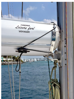
Robust & Refined Componentry