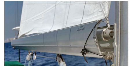
Elegant Tapered Styling