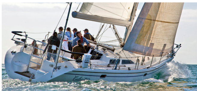
Each VOYAGER System is Customized to Match Your Boat's Specs