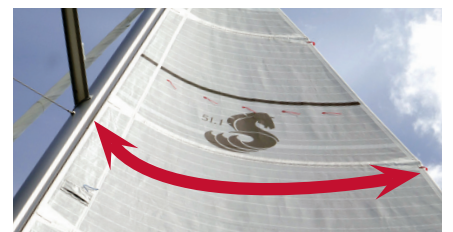
Deep Draft Full Batten Sail Performance

LEISURE FURL™ Worldwide Leader for In-Boom Mainsail Furling Systems