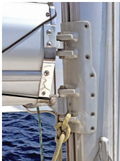
Extended Extra Strong Offshore Gooseneck