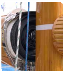
Faux Spruce Finish