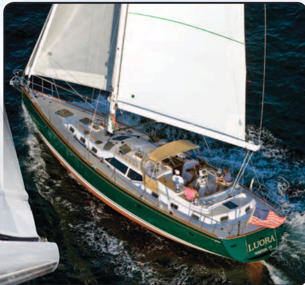
TARTAN 5300 WITH CARBON FIBER BOOM

Nearly 4,000 systems in use, making ocean passages all over the world in all sea conditions. Leisure Furl is a highly efficient, safe and simple method of reefing and controlling the mainsail. The Forespar Leisure Furl is developed, marketed and built by a spar builder of the highest reputation. We have been building spars in the U.S. for over 40 years.